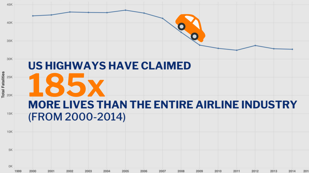
Total Highway Fatalities By Year in the United States (2000-14)

8 AIRLINES ELIMINATED 100% OF THEIR INCIDENTS